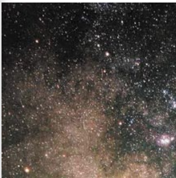
The image on the left shows the wonders of the summer time Milky Way