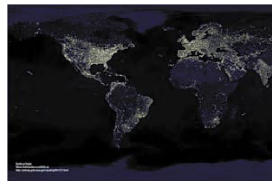
The image on the right shows the amount of wasted light that is overwhelming our skies

Light pollution affects the vast majority of the inhabitants of this planet. Right here in the United States, 4 out of 5 people live under skies that are negatively impacted by light pollution. In fact, more than 50% of Americans can no longer see the Milky Way from their home. Starry Night Lights is committed to fixing the problem, one bad light at a time.